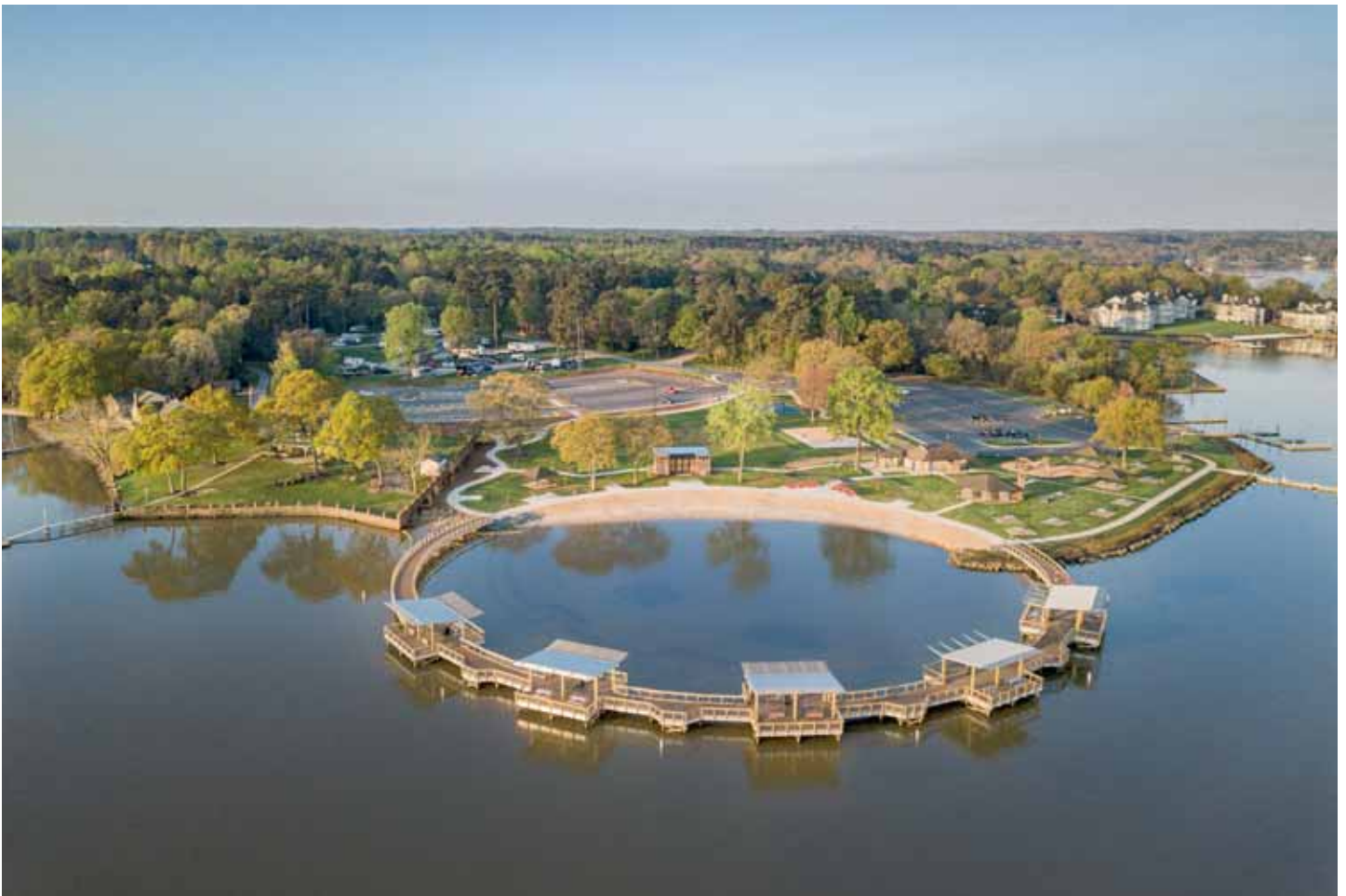
Ebenezer Park