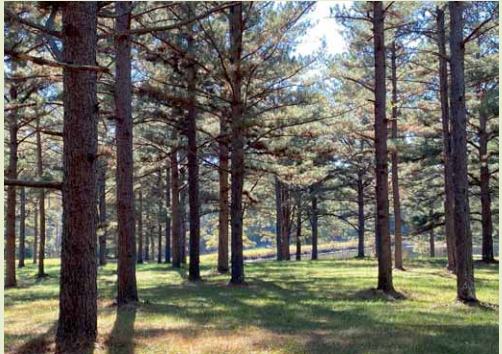
Catawba Bend Preserve

A park loop road will connect the many diverse activities offered, including 25 miles