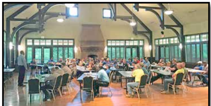
OSHA training class, Cleveland Park, Spartanburg, Apr. 23