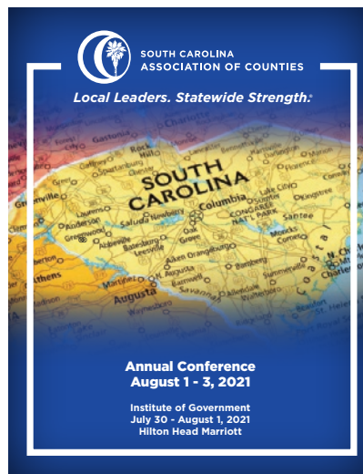
Institute of Government Graduates to be Recognized at the General Session

The following Institute courses will be offered: