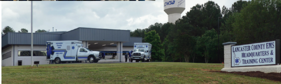
The upper photo shows Lancaster County council members, EMS staff members and others participating in the ribbon-cutting ceremony for the county's new EMS headquarters, shown in the lower photo.