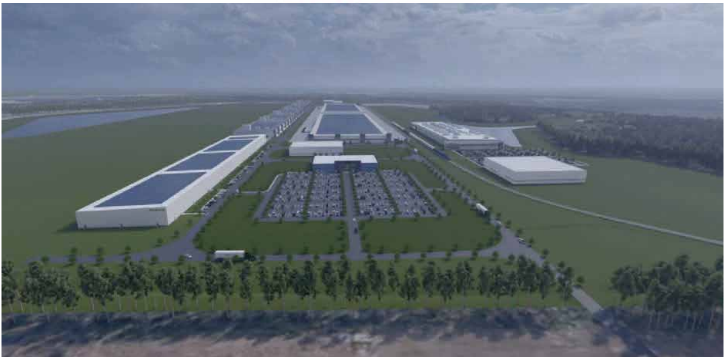
Artist's rendering of Santee Cooper's Camp Hall Commerce Park in Ridgeville