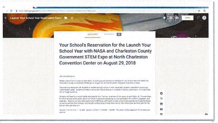
NASA School Announcement