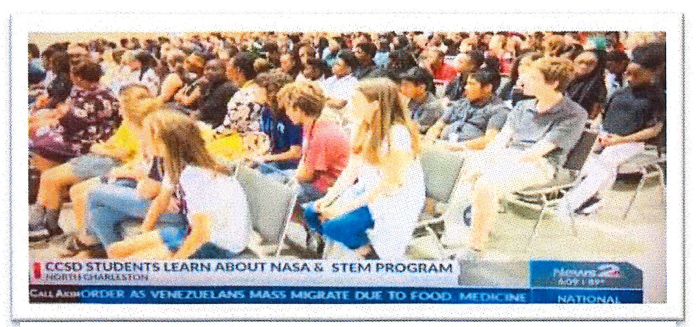
Launch with NASA program made the evening news