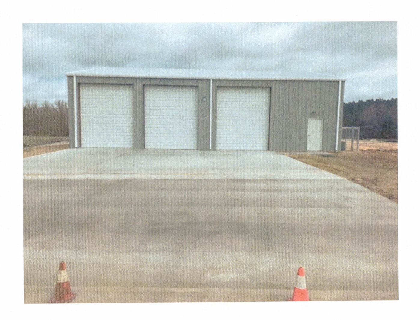
Brightsville Fire Station – Constructed Completed May 22, 2018