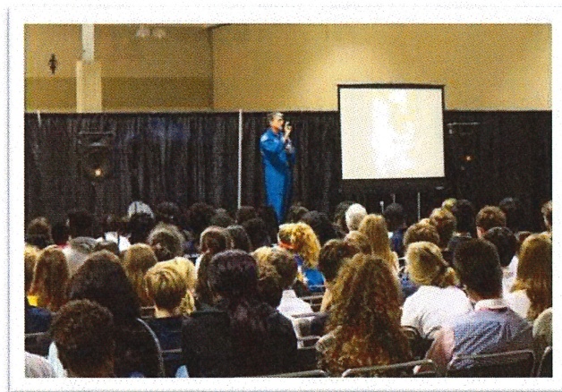
Astronaut Dr. Don Thomas inspires future STEM leaders