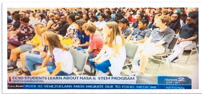
Launch with NASA program made the evening news