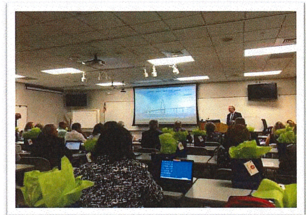
Meeting with NASA and Prime Contractors