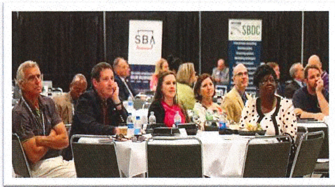
Charleston County elected officials attend Small Business Forum