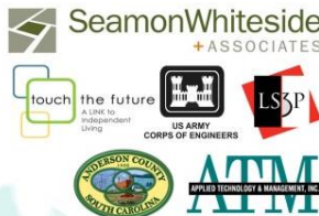
green pond landing event center master plan may 2012